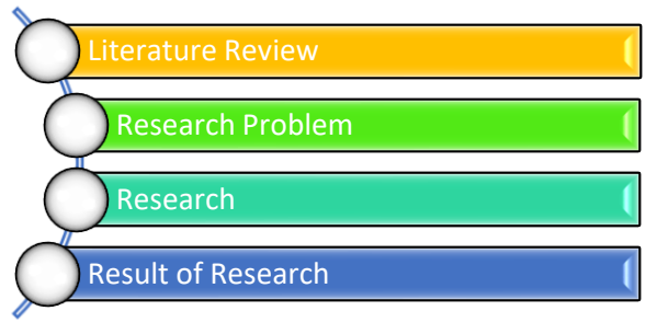
Figure 1. Research Method

In this study using a survey tool that was carried out to 100 sellers of goods who sold their goods using an e-commerce media system that sold goods digitally because in many countries this is a financially profitable thing because it does not require a lot of capital in terms of capital. and can get a lot of profit because the price difference is quite far from opening a shop or selling goods with ecommerce media [12].